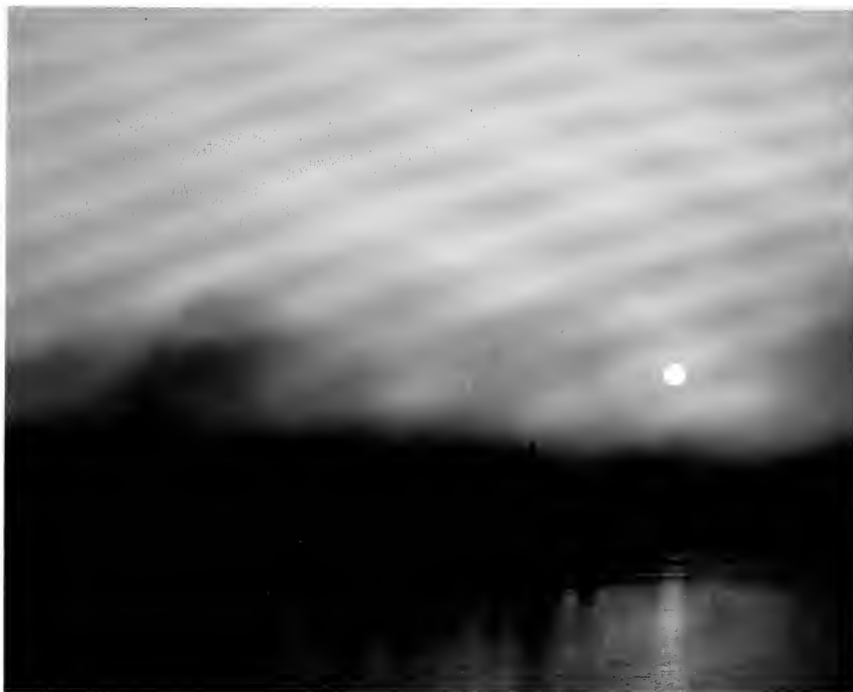
Morning mist: Tom Nelson Eastern kingbird: Jan L. Wassink

“The nation behaves well if it treats natural resources as assets which it must turn over to the next genera- tion—and not impaired in value. . . .”